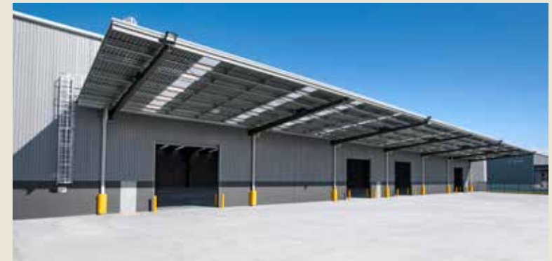
Images shown are of 38 Business Parade North [leased by Mainfreight], which is a similar style planned for 31 Business Parade North

This document has been prepared by Goodman Property Services [NZ] Limited as property manager for Highbrook Development Limited and Highbrook Business Park Limited ["Highbrook"]. It has been prepared for general information purposes. Whilst every care has been taken in relation to its accuracy, no warranty is given or implied. Certain images have been used to enable you to visualise the development concepts. Further, you should obtain your own independent advice before making any decisions about any of the products and/or properties referred to in this document. Highbrook Business Park is owned by Highbrook. All values are expressed in New Zealand currency unless otherwise stated. September 2015.