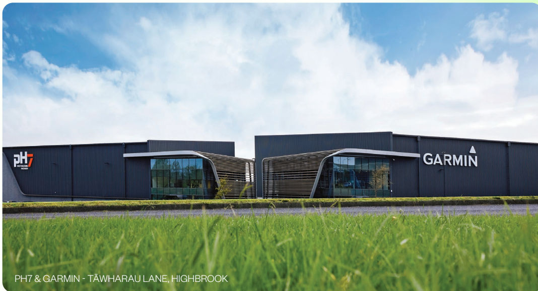
PH7 & GARMIN - TĀWHARAU LANE, HIGHBROOK